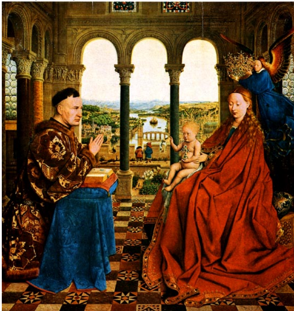
BELOW: Madonna and Chancellor Rollin by Van Eyck