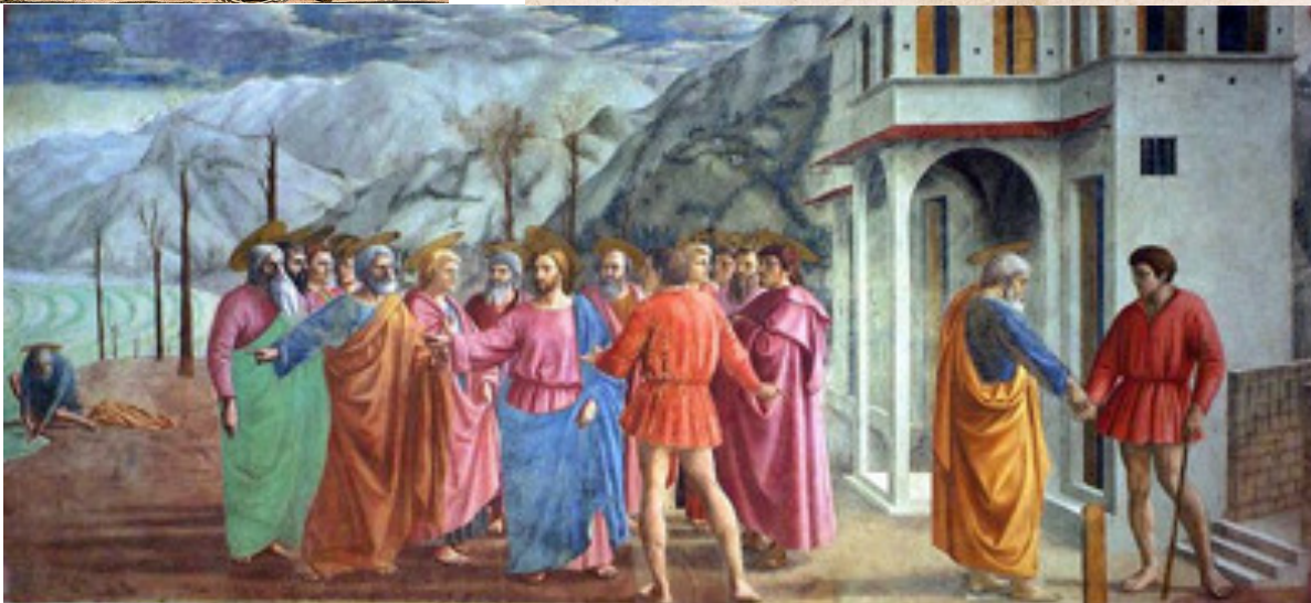
The Tribute Money by Masaccio