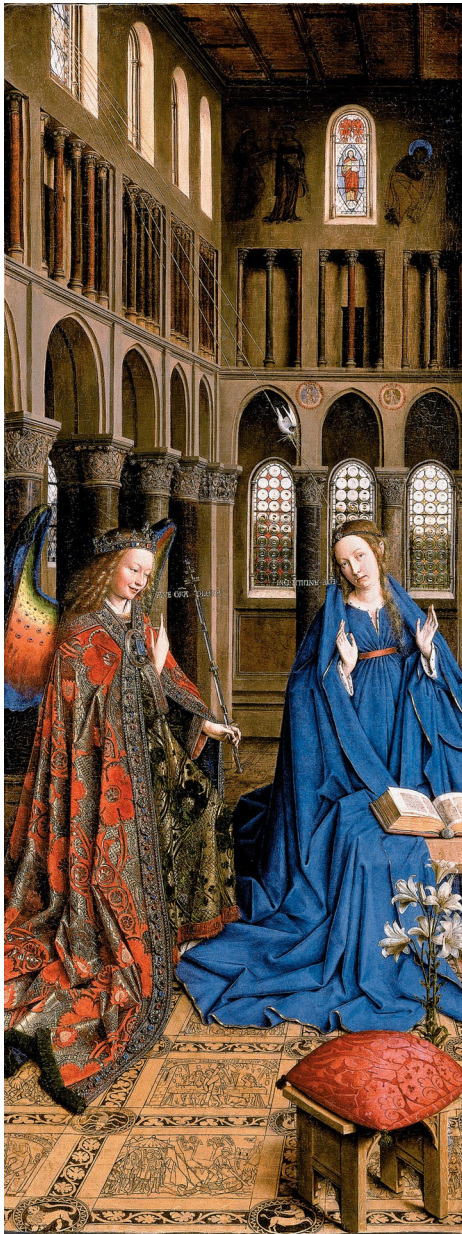
LEFT The Annunciation by Van Eyck BELOW Young Hare by Albrecht Durer