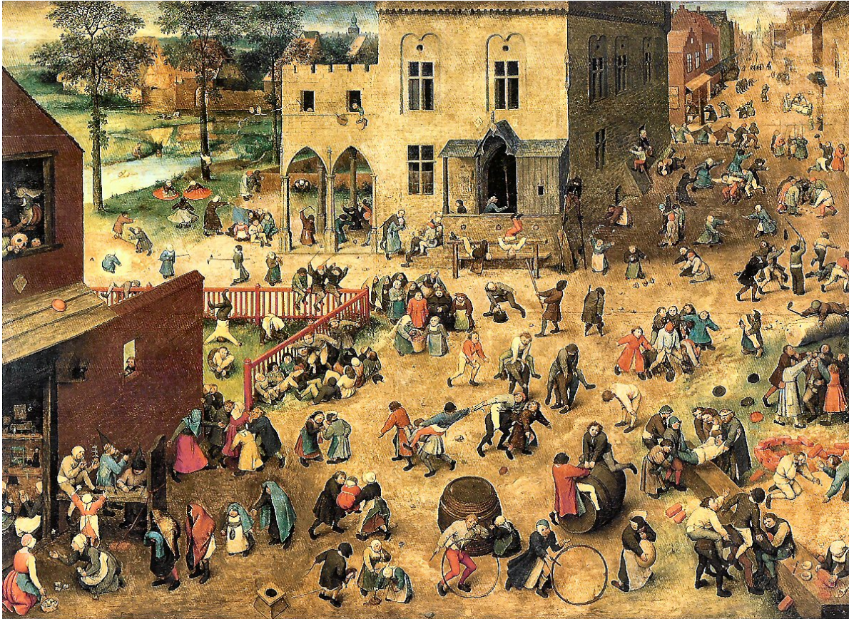
ABOVE – Children's Games