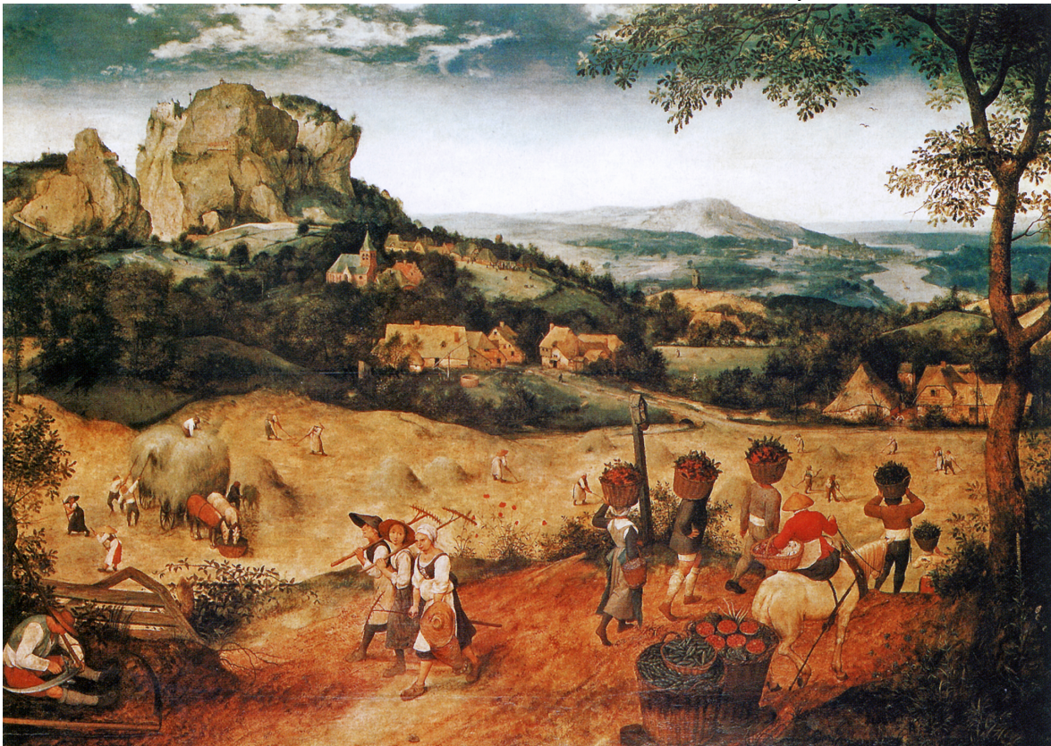
BELOW – The Hay Harvest